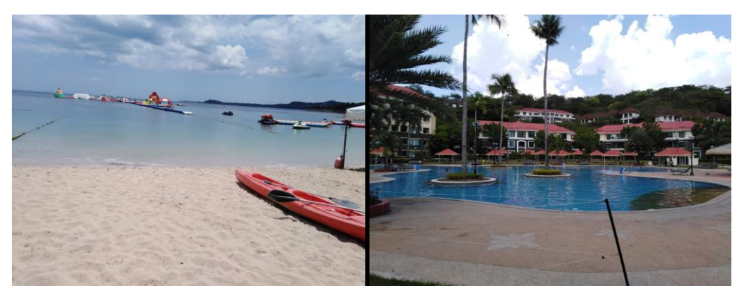
For more details about the resort, visit their website: http://canyon.ph/canyon-cove/